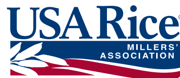
PHOTO RELEASE: Any photographs taken at convention events by RMA/USA Rice may be used in publicizing RMA/USA Rice events including this and future conventions.